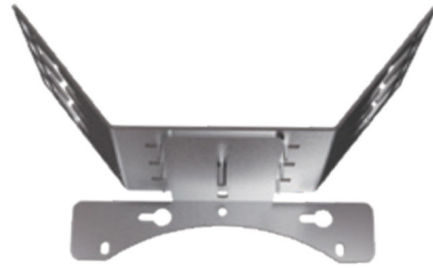
Shown in galvanized

Butterfly Brackets For New Construction Frame (field installable). Designed for use with Green Creative Selectfit Retrofit Series.