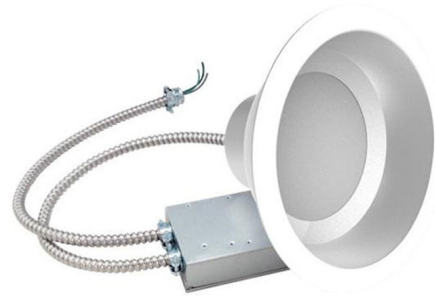
Shown in white / aluminum

The CDL Commercial Retrofit Downlight with External Driver Junction Box retrofits existing commercial housings and is field accessible from below the ceiling. Self-flanged spun aluminum reflector with white painted trim flange and polycarbonate optical lens with 90 degree beam angle. Includes friction clips allowing for easy installation of aluminum reflector and quick connect wire harness for easy wiring installation. Universal 120-277V LED driver in external driver junction box dims to 5% using electrically isolated 0-10V circuit. Note: Limited options available.