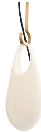
Shown in brushed brass / opaque white

PRODUCT DIMENSIONS . . . . . Canopy: 5" diameter COLOR RENDERING . . . . . 90 CRI LAMP COLOR . . . . . 3000K LUMENS/WATT . . . . . 100.00 LUMINOUS FLUX . . . . . 450 lumens