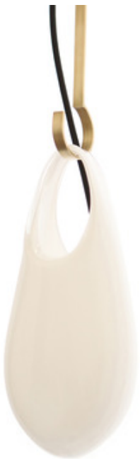
Shown in: Brushed Brass / Opaque White

The Hold Pendant features an expressive glass vessel, appearing to droop from a double-ended brass hook hanging from a loop at the canopy. A Brass socket is held from a fabric-wrapped electrical cord and suspends the light bulb within the opening of the glass. Accommodates sloped ceilings. 12 inch size is Damp Location rated. Note: Overall drop length must be specified when ordering. Small size: 28 to 42 inches. Large size: 33 to 48 inches. Custom drop lengths available for an additional fee.