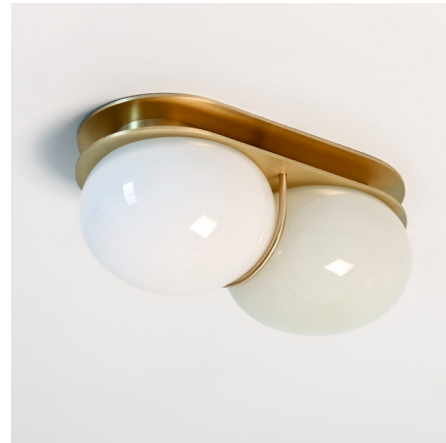
Shown in brushed brass / white / beige

The Twin 2.0 Wall / Ceiling Light features a two-tone diffuser of handblown Czech Glass held by a Brass band and canopy. Due to the handblown Glass, all dimensions are approximate.