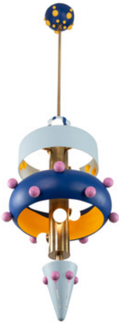
Shown in: Aged Brass

The Jackson Pendant is a display of collaboration and play. It features hand sculpted clay designs arranged together to encourage open-ended play and imagination. The design is centered around an Aged Brass core. Crafted by hand in Savannah, Georgia, USA.Note: Please specify overall drop length when ordering.