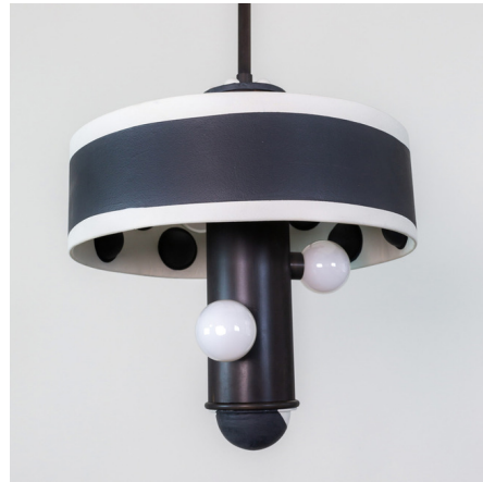
Shown in blackened brass

PRODUCT DIMENSIONS . . . . . Canopy: 6" diameter COLOR RENDERING . . . . . 90 CRI LAMP COLOR . . . . . 2700K LUMENS/WATT . . . . . 266.67 LUMINOUS FLUX . . . . . 1200 lumens