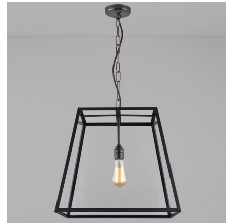
Shown in weathered brass / clear

The Quad Damp Pendant brings a clean geometric look to your interior or exterior space. Clear glass panels are complemented by a slanted frame. Available in four sizes. Includes a 71 inch cable.