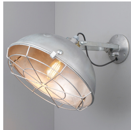
Shown in galvanized silver

The Steel Working Industrial Wall Sconce brings a clean industrial look to your interior space. The dome shaped diffuser is adjustable and accented with a cage that casts warm shadows downward into your room.