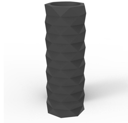
Shown in anthracite