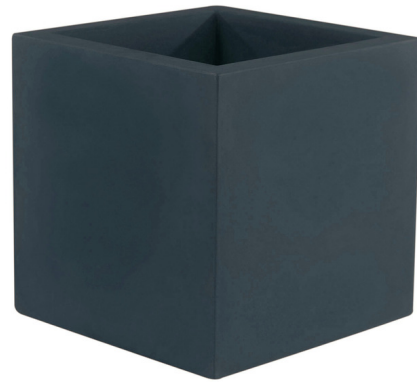
Shown in anthracite

Showoff your green thumbs with the Studio Vondom Cube Planter. This versatile garden planter is made out of rotational molding Polyethylene Resin and is 100% recyclable. Sporting a lightweight design, this indoor/outdoor planter is perfect for planting vegetables, herbs or houseplants.