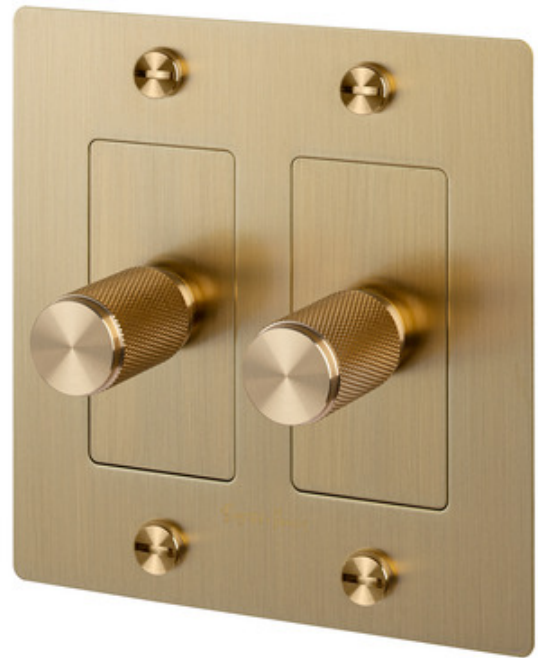
Shown in: Brass

The Buster + Punch Complete Dimmer Switch is made from solid metal with a diamond cut knurled knob available in White, Black, Steel, Smoked Bronze, or Brass. Dims halogen (10-600 watt) incandescent, and most LED (5-150 watt) loads. The Complete Dimmer includes push On/Off rotary dimmer module compatible with 3-way switching, wall plate, and detail kit. Note: Dimmable with leading edge (TRIAC) dimmers. Does not dim with MLV or 0-10V dimmers. See attached manufacturer spec for more information. Disclaimer: Only one dimmer should be used per 3-way circuit; 2 Gang Dimmers should not share a 3-way circuit.