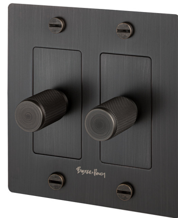
Shown in smoked bronze

The Buster + Punch Complete Dimmer Switch is made from solid metal with a diamond cut knurled knob available in White, Black, Steel, Smoked Bronze, or Brass. Dims halogen (10-600 watt) incandescent, and most LED (5-150 watt) loads. The Complete Dimmer includes push On/Off rotary dimmer module compatible with 3-way switching, wall plate, and detail kit. Note: Dimmable with leading edge (TRIAC) dimmers. Does not dim with MLV or 0-10V dimmers. See attached manufacturer spec for more information. Disclaimer: Only one dimmer should be used per 3-way circuit; 2 Gang Dimmers should not share a 3-way circuit. Learn more about Buster + Punch Electricity Collection here.