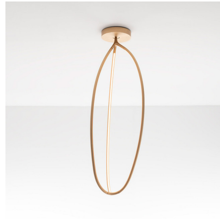
Shown in brass

LAMP LIFE . . . . . 50000 hours COLOR RENDERING . . . . . 90 CRI LAMP COLOR . . . . . 3000K LUMENS/WATT . . . . . 101.13 LUMINOUS FLUX . . . . . 1618 lumens