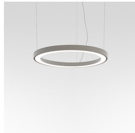
Shown in white

PRODUCT DIMENSIONS . . . . . Canopy: 8" diameter LAMP LIFE . . . . . 50000 hours COLOR RENDERING . . . . . 90 CRI LAMP COLOR . . . . . 3000K LUMENS/WATT . . . . . 85.30 LUMINOUS FLUX . . . . . 1706 lumens