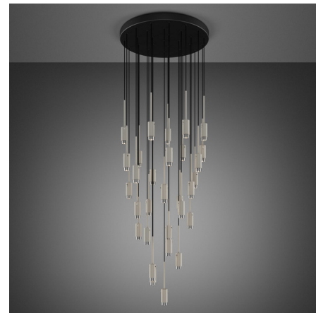
Shown in stone / steel

PRODUCT DIMENSIONS . . . . . Canopy: 31.4" diameter