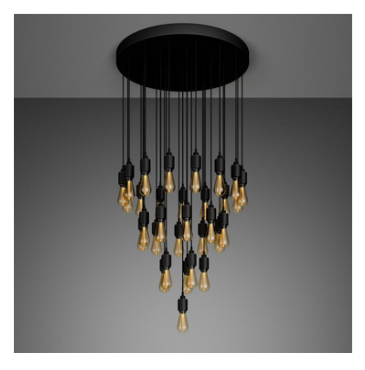
Shown in: Smoked Bronze