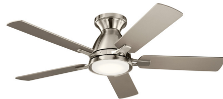
Shown in brushed stainless steel / silver / weathered white walnut

PRODUCT DIMENSIONS . . . . . Adjustable Overall Height: 10.25" to 15.25" LAMP LIFE . . . . . 40000 hours COLOR RENDERING . . . . . 90 CRI LAMP COLOR . . . . . 3000K LUMENS/WATT . . . . . 82.35 LUMINOUS FLUX . . . . . 1400 lumens