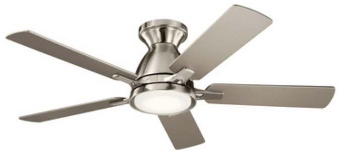
Shown in: Brushed Stainless Steel / Silver / Weathered White Walnut

The Arvada Ceiling Fan with Light features a sleek, industrial-inspired look. It has 5 reversible wooden blades, 44 inch blade sweep, 12 degree blade pitch, a 6 inch downrod, and a 153 mm x 12 mm AC motor. A full function wall control is included and enables 3 speeds, forward and reverse, motor on/off, and lights on/off with full-range dimming. The fan is low ceiling adaptable, with a dual mount included. The integrated LED light is covered with a frosted white glass diffuser. Additional optional downrods and controls are sold separately. Available in:- Anvil Iron finish with reversible Distressed Antique Gray and Walnut blades- Brushed Stainless Steel finish with reversible Silver and Weathered White Walnut blades- Satin Black finish with reversible Satin Black and Weathered White Walnut blades