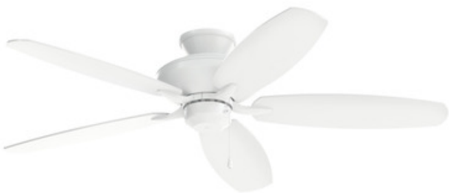
Shown in: Matte White / Matte White / Distressed Antique Gray

The Renew Ceiling fan carries a soft, modern design aesthetic inspired by the clean lines of a Nordic vase. With its universal style featuring gently curved blades and a smooth motor housing with no visible vents, it easily integrates with a variety of spaces and decor schemes. The fan has 5 reversible wooden blades, a 52 inch blade sweep, 12 degree blade pitch, 4.5 inch downrod, and 153 mm x 18 mm AC motor. A 3-speed pull chain is included, and reverse can be set using the switch on the motor housing. This fixture is low ceiling adaptable with the included dual mount. Optional controls and downrods are sold separately. Available in:- Brushed Stainless Steel finish with reversible Satin Black and Silver blades- Matte White finish with reversible Matte White and Distressed Antique Gray blades- Oil Brushed Bronze finish with reversible Cherry and Walnut blades- Satin Black finish with reversible Satin Black and Silver blades