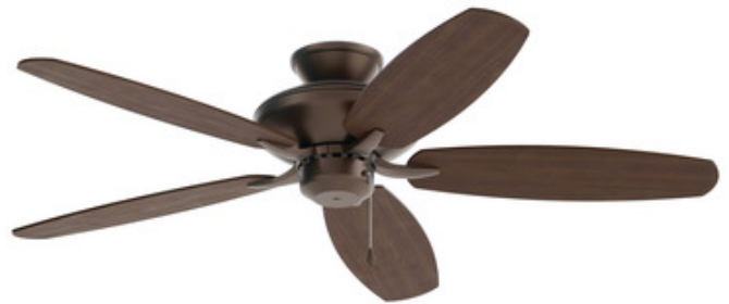
Shown in: Satin Natural Bronze / Cherry / Walnut

Gently curved blades and a smooth motor housing with no visible vents give the Renew Patio Ceiling Fan a soft, modern design aesthetic inspired by a Nordic Vase. It is perfect for bringing comfort to kitchens and living rooms or covered outdoor spaces including porches and patios. The fan has 5 reversible wooden blades, a 52 inch blade sweep, 12 degree blade pitch, 4.5 inch downrod, and 153 mm x 18 mm AC motor. A 3-speed pull chain is included, and reverse can be set using the switch on the motor housing. This fixture is low ceiling adaptable with the included dual mount. Optional controls and downrods are sold separately. Available in:- Brushed Nickel finish with reversible Satin Black and Silver blades- Matte White finish with reversible Matte White and Distressed Antique Gray blades- Satin Black finish with reversible Satin Black and Silver blades- Satin Natural Bronze finish with reversible Cherry and Walnut blades