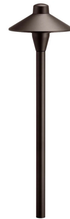
Shown in textured architectural bronze

The 12 Volt Path Light is ideal for all drop in LED path and spread needs. This fixture features thick cast construction, a glass lensed dome, and an easy one point shade connection. Includes 48 inch usable #18-2, SPT-1W leads, 8 inch in ground slotted stake, and 2 gel-filled wire nuts. Note: Required low voltage transformer and optional accessories sold separately.