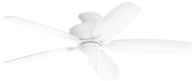
Shown in: Matte White / Matte White / Distressed Antique Gray

The Renew Energy Star Ceiling Fan was inspired by a Nordic Vase and features a soft, modern design with gently curved blades and no visible vents in the motor housing. It is Energy Star Qualified, due to its large, energy-efficient DC motor that offers superior air movement. The fan has 5 reversible wooden blades, a 52 inch blade sweep, 12 degree blade pitch, 4.5 inch downrod, and 155 mm x 16 mm DC motor. A 3-speed pull chain is included, and reverse can be set using the switch on the motor housing. This fixture is low ceiling adaptable with the included dual mount. Optional controls and downrods are sold separately. Available in:- Brushed Stainless Steel finish with reversible Satin Black and Silver blades- Matte White finish with reversible Matte White and Distressed Antique Gray blades- Oil Brushed Bronze finish with reversible Cherry and Walnut blades- Satin Black finish with reversible Satin Black and Silver blades