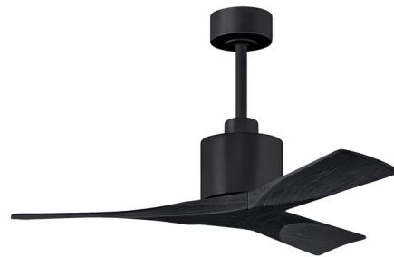
Shown in matte black / matte black