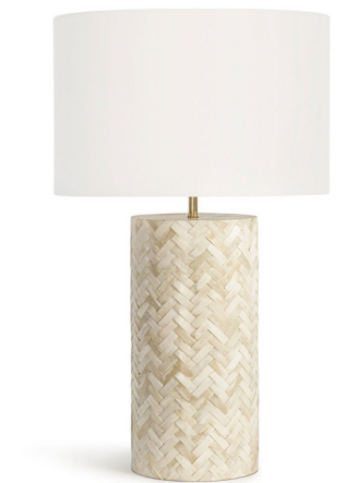
Shown in natural / white

PRODUCT DIMENSIONS . . . . . Shade: 18" diameter x 11"H