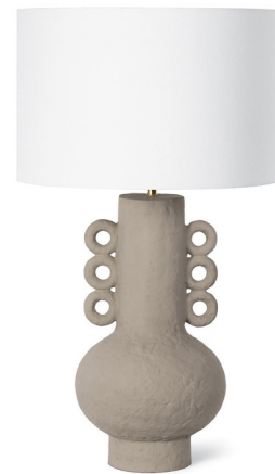
Shown in brown / white

PRODUCT DIMENSIONS . . . . . Shade: 17" diameter x 11"H