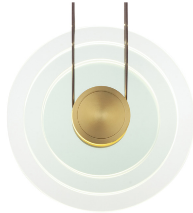
Shown in natural aged brass / clear

The Stratum Pendant is composed of a series of thick glass circles layered between discs finished in Natural Aged Brass. The assembly hangs from faux leather straps that hide the electrical wiring, and a concealed LED tube evenly distributes light in all directions while highlighting the curved, offset glass outlines. With this unique design, the Stratum is an eye-catching piece that elevates your lighting. The 2022 Chicago Athenaeum Museum of Architecture & Design Good Design Award winner.