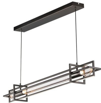
Shown in gunmetal / clear

PRODUCT DIMENSIONS . . . . . Adjustable Overall Height: 8.75" to 129.95" LAMP LIFE . . . . . 25000 hours COLOR RENDERING . . . . . 80 CRI LAMP COLOR . . . . . 3000K LUMENS/WATT . . . . . 396.00 LUMINOUS FLUX . . . . . 990 lumens