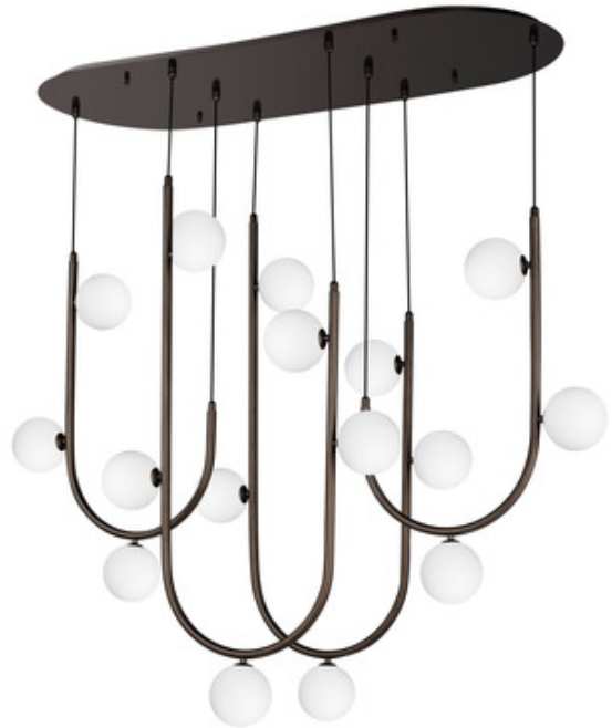
Shown in: Brushed Bronze / White Glass

Simple curves hung from cords are ornamented with enchanting satin white glass lights, making the unique Contour 16-Light Pendant a modern, lively addition to your design scheme. Compatible with a Triac or electronic low voltage (ELV) dimmer, sold separately. Note: the Polished Chrome finish includes 4000K bulbs, and the Brushed Bronze and Heritage finishes include 3000K bulbs.