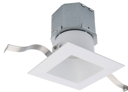
Shown in white / frosted