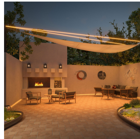
Shown in white

LAMP LIFE 50000 hours BEAM ANGLE 160° COLOR RENDERING 94 CRI LAMP COLOR 2000K-6000K Tunable White LUMENS/WATT 354.00 LUMINOUS FLUX 1770 lumens