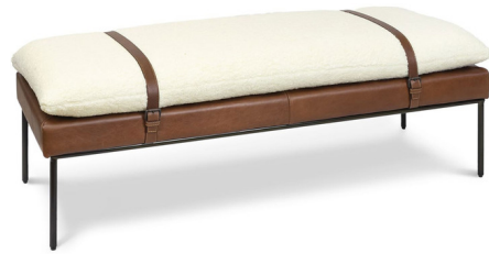
Shown in black / white faux wool / brown leather

The Aspen Bench features a white faux boucle wool cushion with brown leather accents supported by a black metal frame. Its modern styling makes Aspen a perfect addition to a hallway, foyer, or at the foot of the bed in a contemporary bedroom.