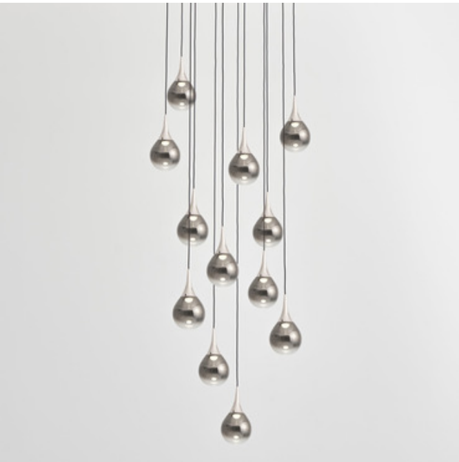
Shown in: Chrome / Chrome

Inspired by organic shapes and the artistry of fine jewelry, the Paopao Chandelier is a cluster of elegant teardrop silhouettes composed of glass spheres with matching metal caps. The glass is hand-blown and vacuum-plated in layers to create a beautiful gradient. Like a bubble, it produces a mesmerizing play of light and color as it reflects its surroundings and the inner light. The down beam angle of 58 degrees prevents undesirable glare while ensuring sufficient illumination. This alluring chandelier elevates your space with its chic design. Built-in dimmable driver.