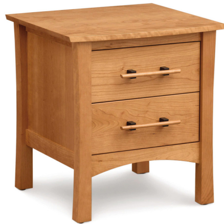
Shown in natural cherry

The Monterey Nightstand evokes classic Arts and Crafts design with a subtle Asian influence. Understated curves and wooden pull bars with dark accents provide a sophisticated accent to the Cherry wood frame with veneer back and sides.