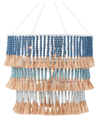
Shown in white / blue

The St. Barts Chandelier is made of wood beads in a mix of hues that echo colors from nature. These hang from a tiered wrought iron frame in a sugar white finish. The natural abaca rope on which the beads are strung is knotted and snipped by hand to leave elemental tassels that will flutter when stirred by a lively breeze. The beaded chandelier is one of several ocean-inspired designs by Beckwith.