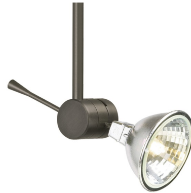
Shown in antique bronze

The Sprocket Freejack Head is simple in design, but extremely functional, featuring several modern customization possibilities. Compatible for use with 1-circuit Monorail track system, Wall Monorail or Freejack canopy. One 12 volt, up to 75 watt GU5.3 MR16 halogen lamp is required, but not included. Includes a Freejack connector. Freejack canopy required when used as a monopoint, sold separately. LED canopy compatible with both halogen and LED lamp options. Dimmer type dependent on system transformer (low voltage magnetic or electronic).