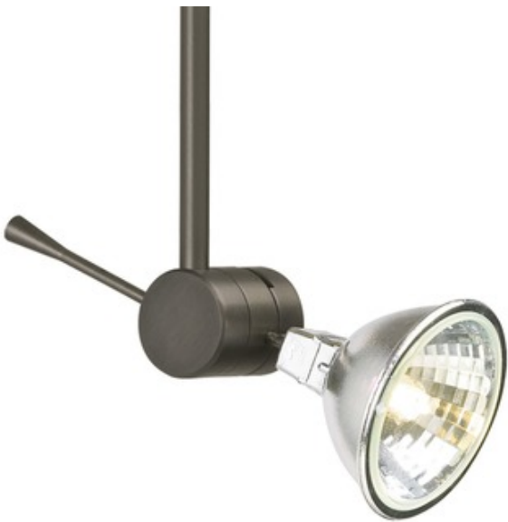
Shown in: Antique Bronze

The Sprocket Freejack Head is simple in design, but extremely functional, featuring several modern customization possibilities. Compatible for use with 1-circuit Monorail track system, Wall Monorail or Freejack canopy. One 12 volt, up to 75 watt GU5.3 MR16 halogen lamp is required, but not included. Includes a Freejack connector. Freejack canopy required when used as a monopoint, sold separately. LED canopy compatible with both halogen and LED lamp options. Dimmer type dependent on system transformer (low voltage magnetic or electronic).