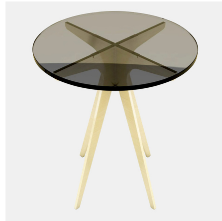
Shown in satin brass / bronzed glass

The Dean Round Side Table will add a touch of mid-century modern design into any contemporary space. It features a sleek Metallic Metal base topped with a round Clear, Smoked, or Bronzed Glass top.