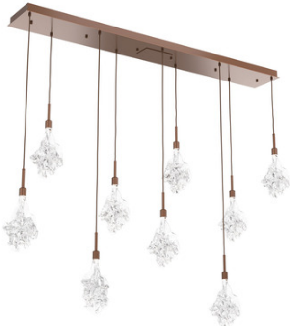
Shown in: Burnished Bronze / Clear

The Blossom Linear Multi Light Pendant features blossoms of LED lit hand blown glass that are meticulously crafted by Hammerton artisans. The fixture is a whimsical celebration of organic aesthetic that exudes casual sophistication. Each shade takes the place of a traditional bulb and unfolds with striking illumination. The finished look is relaxed, soft and unique. Each glass shade is a one-of-a-kind artisan creation. Available with 7, 9, or 10 light options.