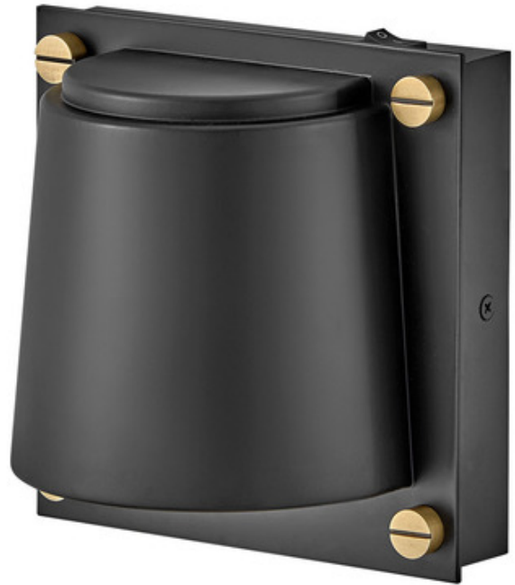
Shown in: Black / Etched Glass

The Scout Wall Sconce subtly catches your eye with its compact, modern design and contrasting, oversized screws. Scout accents a variety of styles. Each fixture includes three interchangeable screws in Black, Heritage Brass, and Brushed Nickel to mix and match as you choose, along with an etched glass diffuser. On/Off switch on the top of the frame, makes this sconce perfect as a reading light. Note: Title 24 Compliant with included bulb.