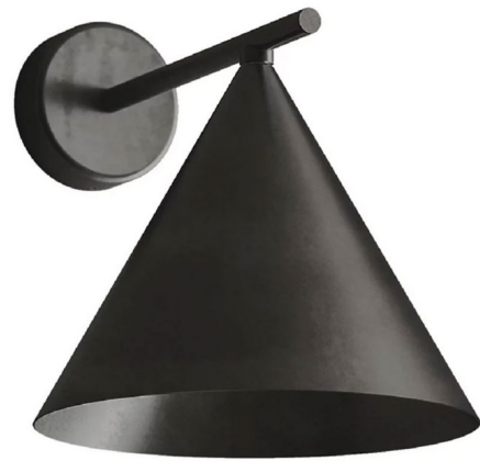
Shown in grafene black

The Cone Wall Sconce pays tribute to a classic silhouette with a natural simplicity. This sleek Iron fixture will elevate any contemporary or industrial space. Ships with US compatible backplate.