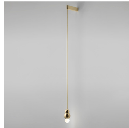
Shown in polished brass / opal

PRODUCT DIMENSIONS . . . . . Adjustable Overall Height: 8"-82" LAMP COLOR . . . . . 2700K LUMENS/WATT . . . . . 125.00 LUMINOUS FLUX . . . . . 250 lumens