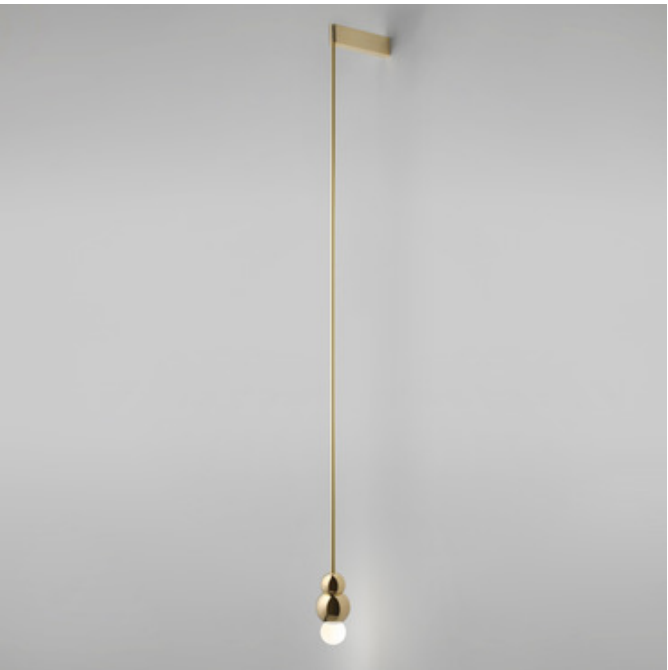
Shown in: Polished Brass / Opal

The Ball Rod Bracket Wall Light, designed around the classic incandescent bulb, is an exercise to abstract the bulb into a perfectly spherical ball, celebrating its perfect shape by repeating it in metal. The brass finish is unlacquered and will naturally oxidize and darken over time. Includes a paintable junction box cover which will cover standard 4 inch junction boxes. The j-box cover extends beyond the fixture and will be visible. Upon ordering, please supply required drop length of fixture, measured from the top of the bracket to the bottom of the socket. Available from 8 to 82 inches. Please contact Customer Service to order.