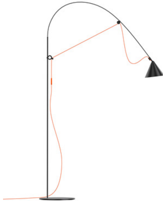
Shown in: Black / Black

The Ayno Floor Lamp tests the boundaries of adjustable lighting, paring down to the essentials while delivering good design, technology, and sustainability. Developed in collaboration with industrial designer Stefan Diez, it features a flexible fiberglass rod bent into an arc by the fabric-covered power cord. The cord is held taut by two adjustment rings that slide along the rod and stem to adjust the tension, pulling the arc tighter or letting it widen. By changing the rod arc and swiveling the lamp shade, light direction can be adjusted to properly illuminate your work space or reading nook. The on/off switch is on the cord. Winner of the 2021 German Sustainability Award and 2022 Bundespreis Ecodesign, this lamp has a black steel stem and base and ABS shade that are made of recycled materials and are recyclable. Resource consumption during production is extremely low due to the lamp's minimalistic construction. Its simple form makes maintenance easy and the LED head can be replaced by the user without tools, extending the lifespan of the lamp.