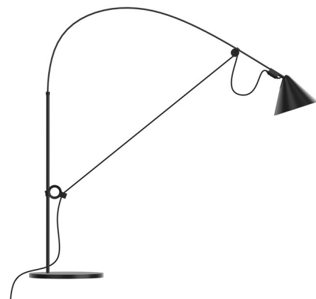
Shown in black / black

COLOR RENDERING . . . . . 90 CRI LAMP COLOR . . . . . 3000K LUMENS/WATT . . . . . 130.00 LUMINOUS FLUX . . . . . 910 lumens