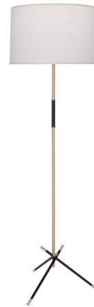
Shown in modern brass / matte black / oyster linen

PRODUCT DIMENSIONS . . . . . Shade Dimensions: 17.5"/19" Dia x 11.5" Slant Height