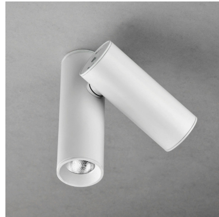
Shown in matte white