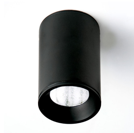
Shown in matte black