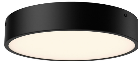
Shown in matte black / frosted

COLOR RENDERING . . . . . 90 CRI LAMP COLOR . . . . . CCT Select LUMENS/WATT . . . . . 51.15 LUMINOUS FLUX . . . . . 1330 lumens