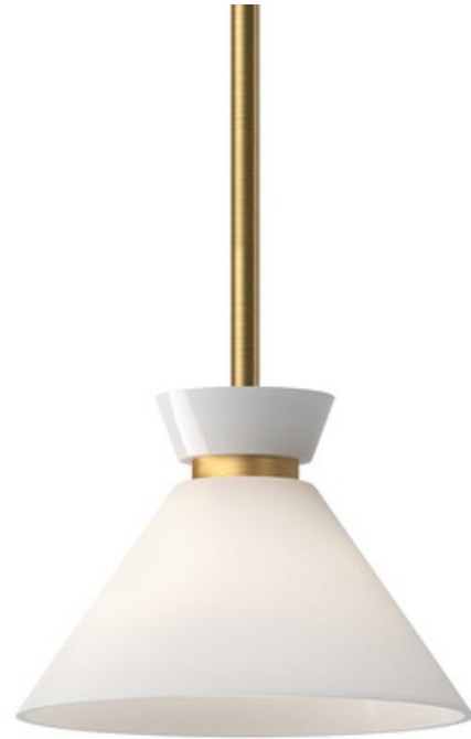
Shown in: Brushed Gold / Glossy Opal

Rooted in the classic silhouettes of 1950s formal wear, the cinched glass shade on the Halston Pendant is given a glossy treatment and accented with a simple metal band. Whether illuminating a bedroom, dining area, or kitchen, this pendant enhances your space with a dash of elegance.