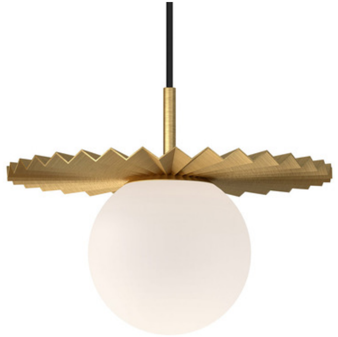
Shown in: Brushed Gold / Opal Matte

The stylish Plume Pendant features a decorative pleated disc inspired by Paris fashion. With the large Opal Matte glass globe, it makes a chic statement in a range of spaces from kitchen counters to dining areas.