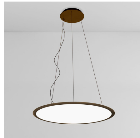
Shown in bronze / transparent

COLOR RENDERING . . . . . 90 CRI LAMP COLOR . . . . . 3000K LUMENS/WATT . . . . . 57.51 LUMINOUS FLUX . . . . . 2835 lumens