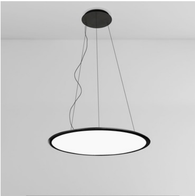
Shown in: Black / Transparent

The Discovery Suspension is based on minimal geometry. An Aluminum, Black, or Bronze ring houses an LED strip that injects light into a specially worked surface of transparent PMMA. The diffuser is composed of a perfectly transparent PMMA surface, processed with micro-particles so small that the surface is hardly perceptible when the fixture is turned off. When the fixture is turned on, the transparent interior appears to fill with light as if by magic. This unique result is obtained through Discovery's direct and indirect emissions, which produce an embracing and uniform light. Their geometry and layout are calculated to obtain constant emission throughout the surface. Dimmable via 2-wire dimming.