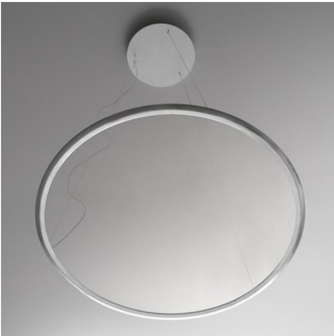
Shown in: Polished Aluminum / Transparent

The Discovery Suspension is based on minimal geometry. An Aluminum, Black, or Bronze ring houses an LED strip that injects light into a specially worked surface of transparent PMMA. The diffuser is composed of a perfectly transparent PMMA surface, processed with micro-particles so small that the surface is hardly perceptible when the fixture is turned off. When the fixture is turned on, the transparent interior appears to fill with light as if by magic. This unique result is obtained through Discovery's direct and indirect emissions, which produce an embracing and uniform light. Their geometry and layout are calculated to obtain constant emission throughout the surface. Dimmable via 2-wire dimming.